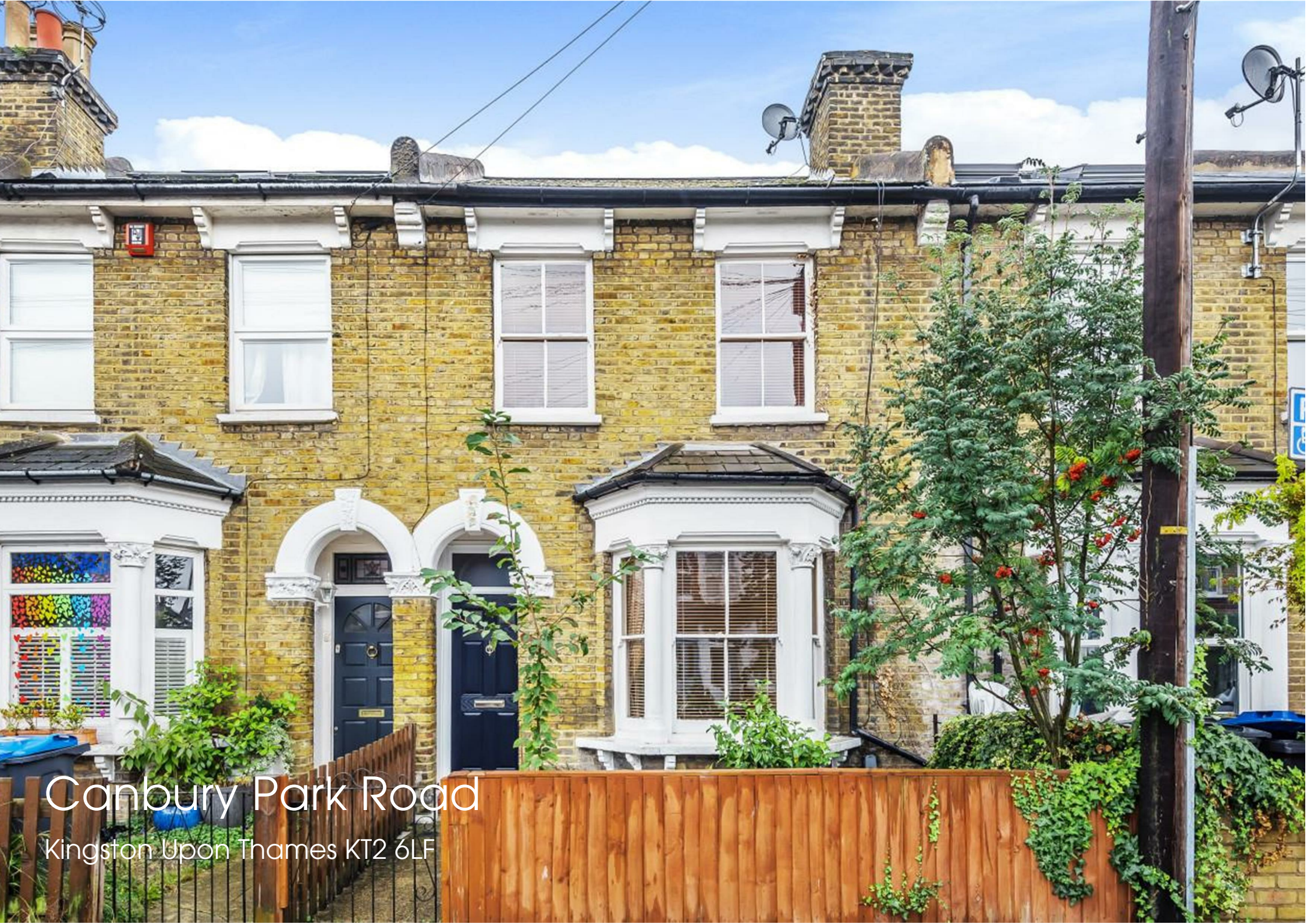
Canbury Park Road Kingston upon Thames KT2 6LF

34 Richmond Road Kingston upon Thames Surrey KT2 5ED www.gibsonlane.co.uk Tel: 020 8546 5444